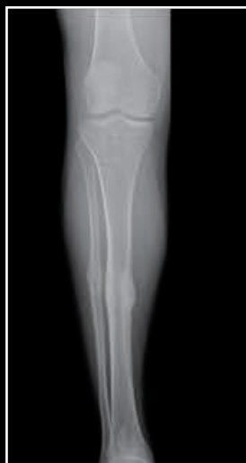
Lower leg, 2 joints, lying