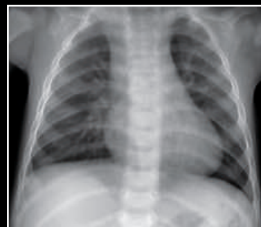
Pediatric chest, a.p., lying