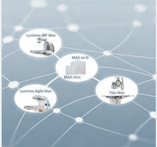
MAXswap enables easy and safe detector sharing between multiple MAX systems.