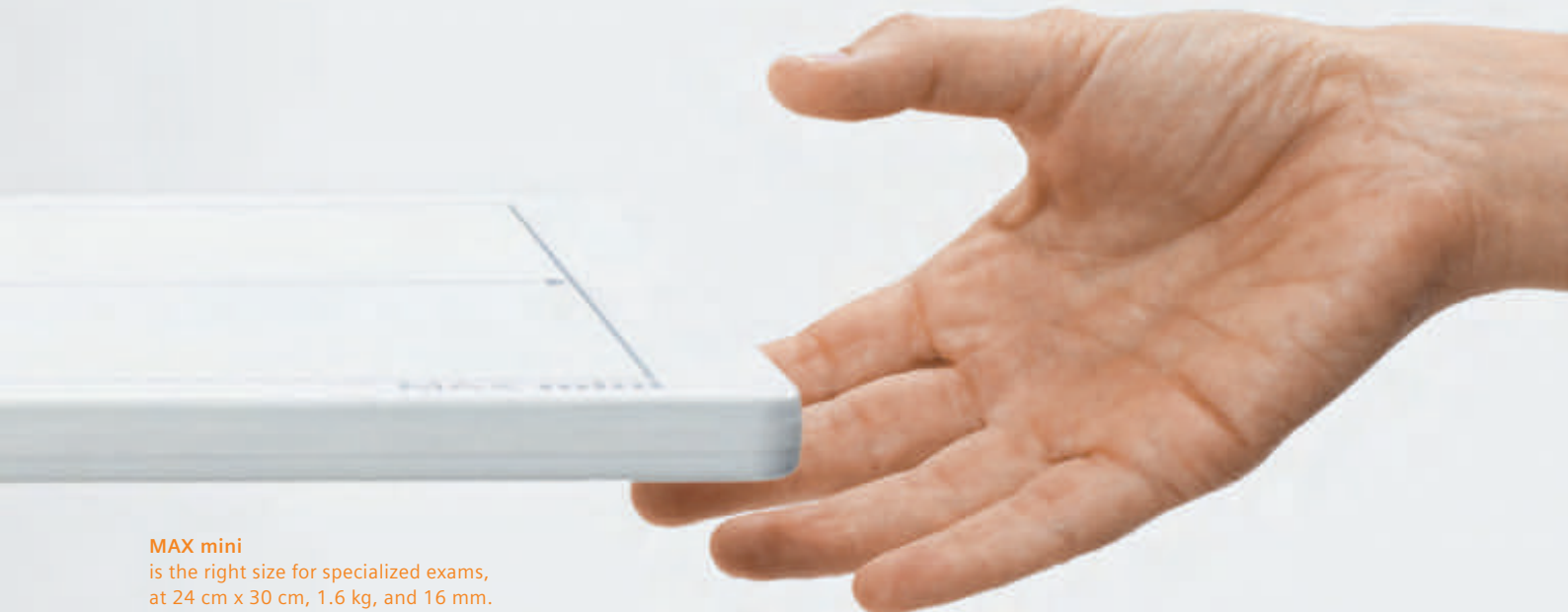
MAX mini is the right size for specialized exams, at 24 cm x 30 cm, 1.6 kg, and 16 mm.