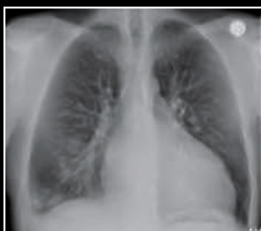
ClearRead Bone Suppression*