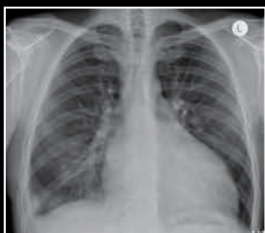
Digital chest X-ray