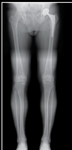
Full leg, standing