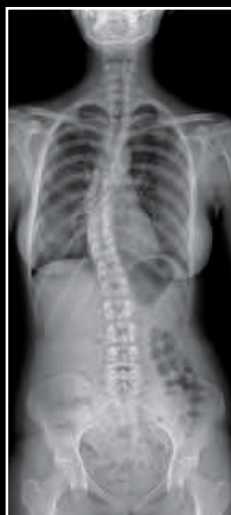
Full spine, standing