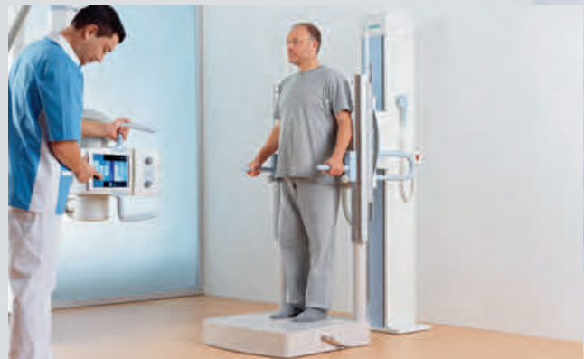
SmartOrtho provides automated ortho imaging using a tilting technique.