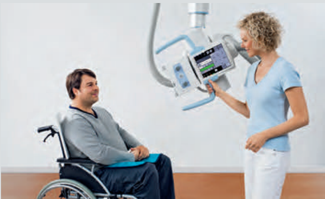
MAXalign makes free exams easier and more accurate.