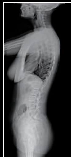
Full spine, standing, lat.