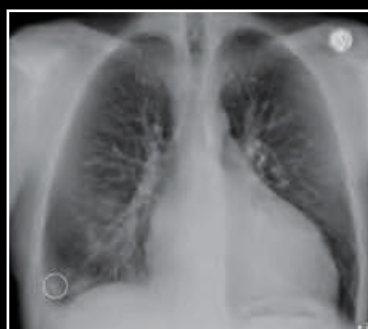
ClearRead Bone Suppression + Detect**