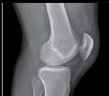
With DiamondView Plus