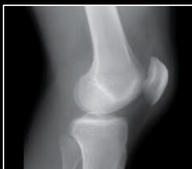
Without DiamondView Plus