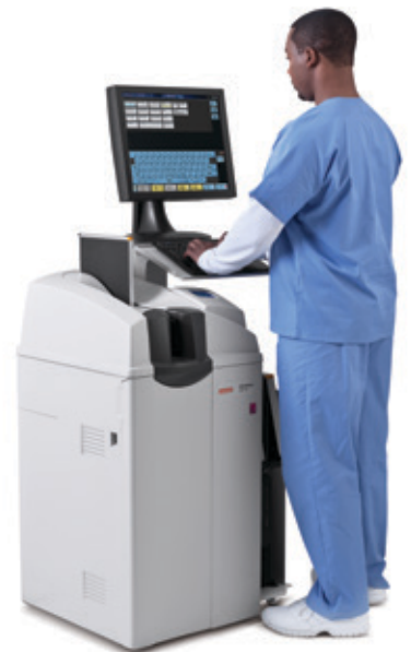
Ideal for use with CARESTREAM DIRECTVIEW CR Systems

The DRYVIEW 5950 Laser Imager is part of the industry's most complete diagnostic imaging portfolio. Carestream offers solutions for the entire imaging chain, including Computed Radiography (CR), Digital Radiography (DR), HIS/RIS, PACS, hardcopy digital output and traditional film and screen products. Choosing Carestream as your imaging partner makes it easy and affordable to meet your current needs and build for your future.